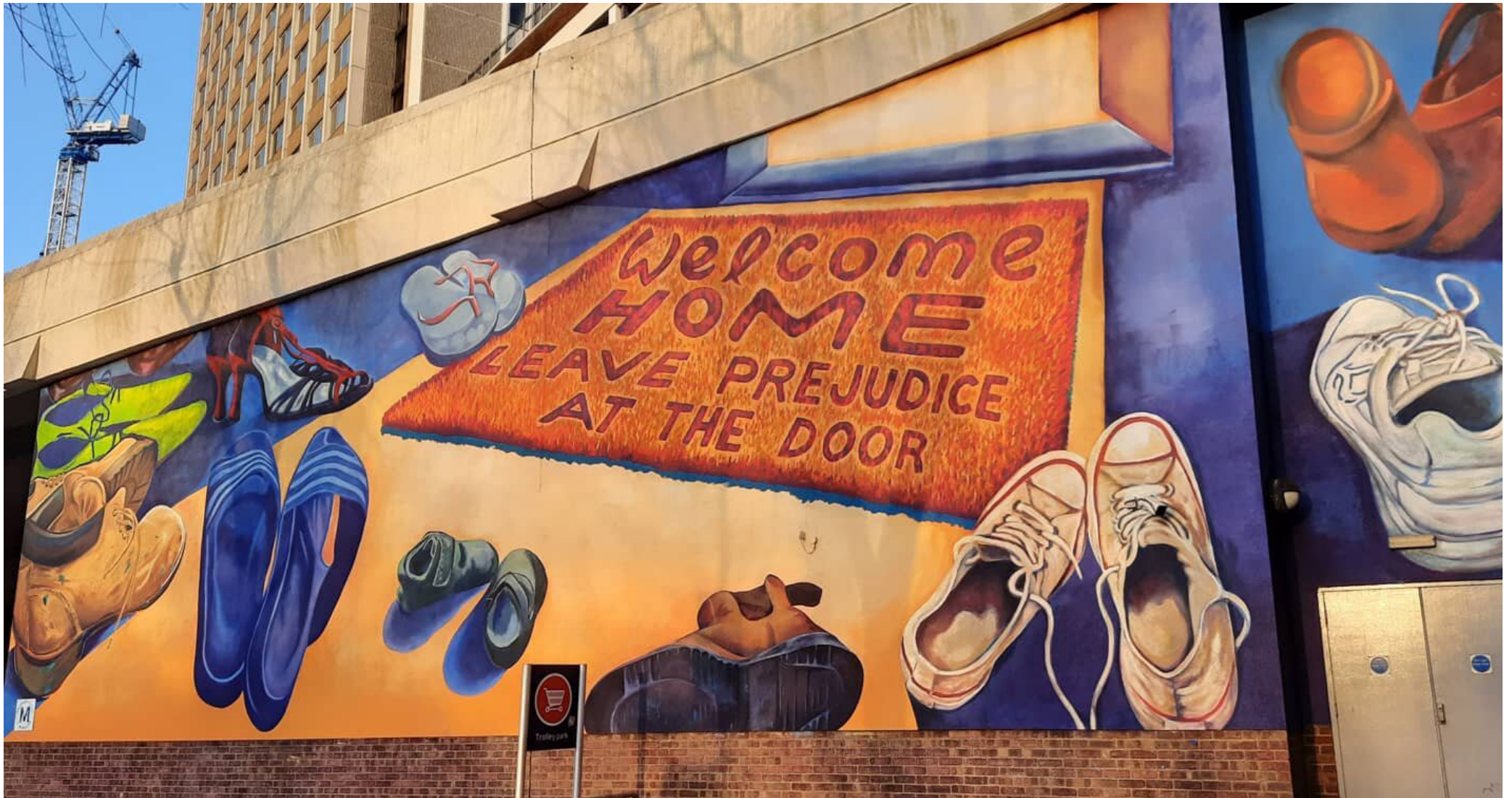
The first cohort's mural about migration on Lewisham Shopping Centre, 2021 in working with the Migration Museum and local residents who had an interest in the subject.